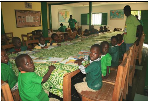
Preschool reading in library