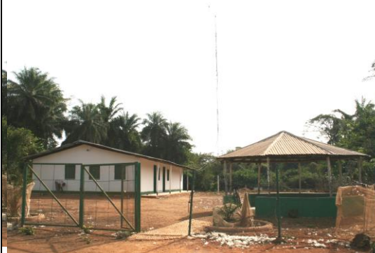
The radio station "Voice of Peace"

Radio Station Opening November 24, 2016! At last it was time for the inauguration of the radio station after two years of test transmissions (6-9 hours / day). Everything was done in the presence of 400 participants, representatives from local and regional authorities, the Ministry of Education, various associations active in the village and the Cacine Association in Sweden. This feels great! Many Swedish associations and individuals have contributed to making this possible.