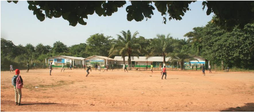
The school in Cacine with the footballground