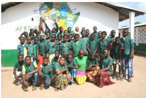
Year 6 at school