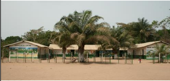
Betel school in Cacine