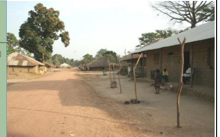
One of the "streets" in Cacine

Hello again all africa interested friends!