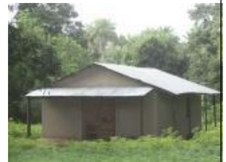
The chapel in Panti bu Jubi

Where you report you're interest as a member, you'll board, bylaws, and you can also read about the projects in Cacine mm. We are also on Facebook.