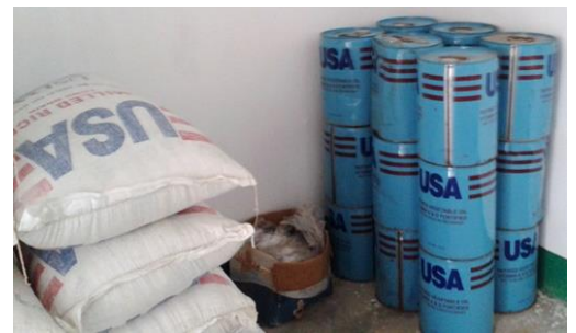
Food supply with rice and oil

companions did some work hours at the raised clay walls. Adjacent to the classrooms is now also a drug store for the school and a storeroom for rice, beans and cooking oil.