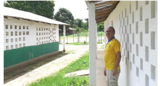
New school building to the right

Some other highlights were the two additional classrooms will be ready to put into use the fall semester 2014. On our visit in January-February 2014, we could see the beginning of the classrooms and some