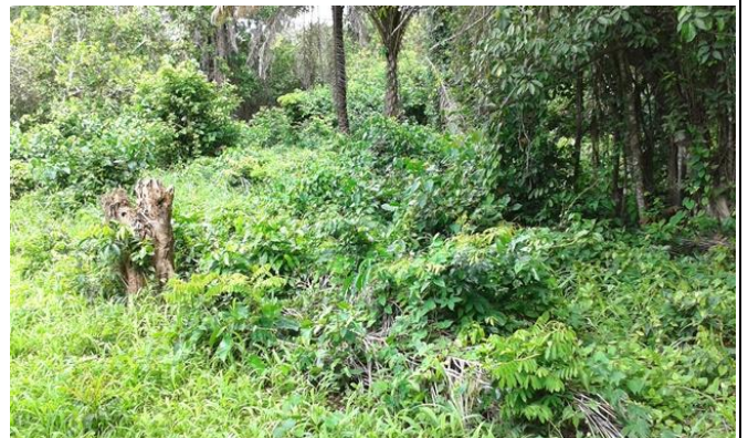
The jungle behind the school where the dormitory will be built