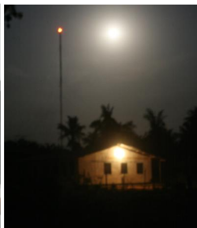
Radiostationen i kvällsbelysning

Then it was time for an excursion to the village of Cassumba. There is a school for about 200 students, we give some help from Sweden. The village is located next to the sea with a huge white beach and there we should swim. However, it was low tide when we arrived, so we had to go a long way to a river and there we were able to swim. The children in the village accompanied us and swam with us. Then we followed them to the village to pick coconuts, Shaulas and Noel's dream.