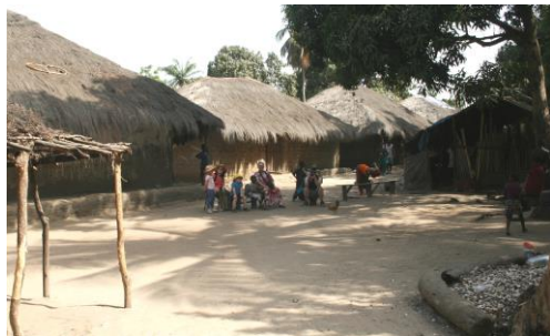
Cassumba village with clay huts

Then it was time for an excursion to the village of Cassumba. There is a school for about 200 students, we give some help from Sweden. The village is located next to the sea with a huge white beach and there we should swim. However, it was low tide when we arrived, so we had to go a long way to a river and there we were able to swim. The children in the village accompanied us and swam with us. Then we followed them to the village to pick coconuts, Shaulas and Noel's dream.