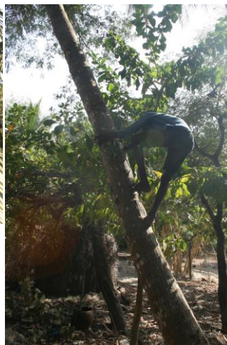
One skilled Climber