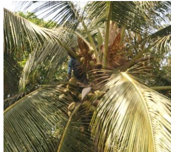
Boy in the palm top