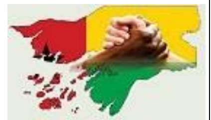
AAEGBs new logo (in Guinea-Bissau)