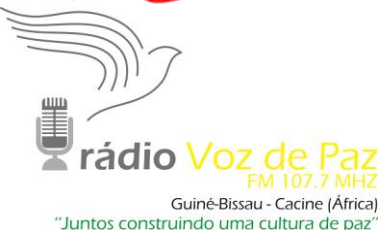
Radio stations logo