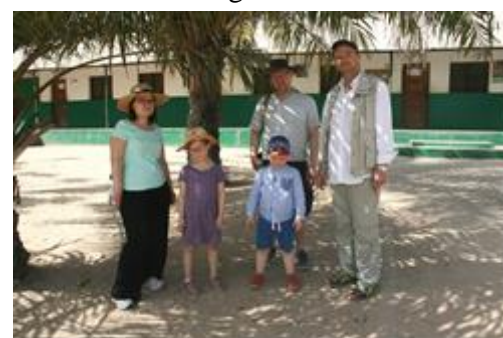
The "gang" at Adonai school in the shadow of a palm tree