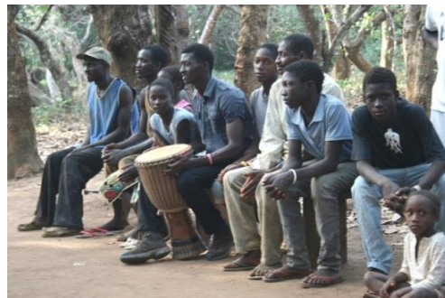
Sunday service in Puntí No Jubi