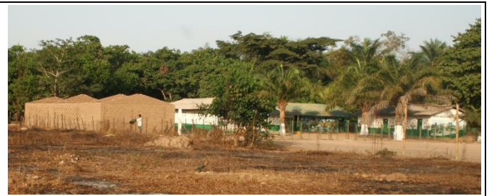
The new school building to the left

Every time we come we are really surprised. This time the school had been expanded with a medical clinic and an additional building with two classrooms and a storage room. The school had started a vegetable cultivation and it provides a good nutritional supplement for the school meals. Students are taught garden care as well. The school has expanded to nearly 600 students!