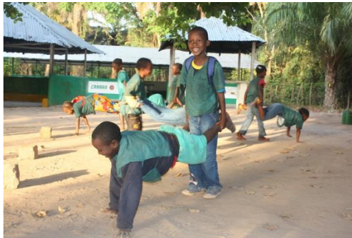
Driving wheelbarrow was popular!