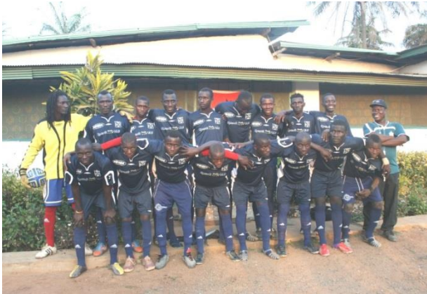
The football team in Cacine in their fine new clothes!

Not just the football team, but the whole village rejoiced over the new clothes. It was like a festival! Now it's just football shoes that are missing (see the photo with plastic sandals). The team now hopes to play in a higher division. We from the homeland of Zlatan, wished them good luck!