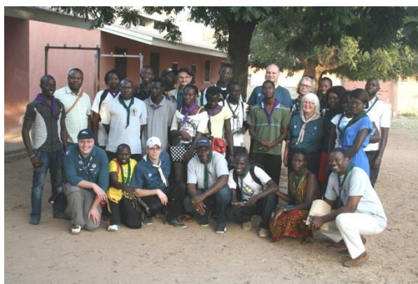
Swedish and Guinean Scoutleaders