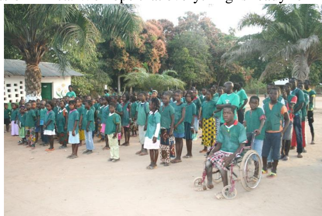
The students at Escola Betel welcomed us on Tuesday morning