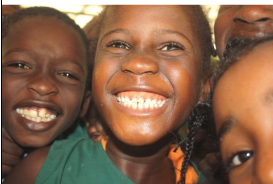
Newly brushed teeth!

Each week, students learn how to brush their teeth and now it was under Swedish leadership. The toothpaste was as a foam around their mouths and it apparently did the trick. The result was brilliant. White teeth.