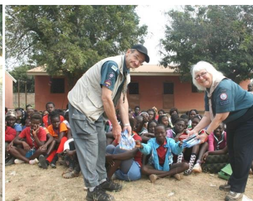
Compasses handed over